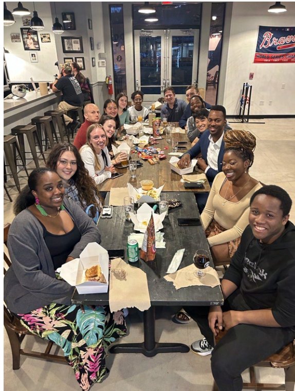
Emory Cares International Day of Service - November 11, 2023