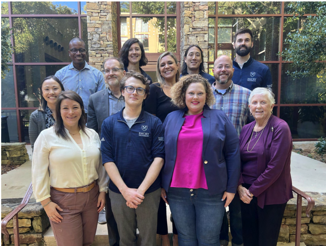
Woodruff Alumni Advisory Board and Program Staff at annual retreat on October 14, 2023.

Season's Greetings! In this edition of the Woodruff Newsletter, we are happy to share information about the Woodruff Alumni Leadership Summit and updates from the fall semester.